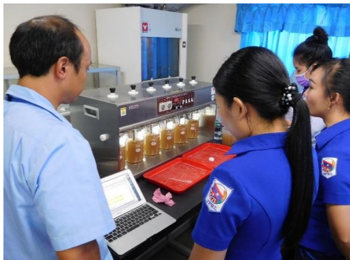
Water quality management guidance in Khammouane