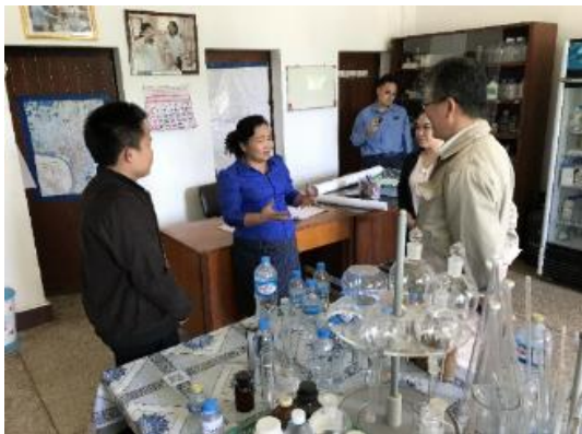
Hearing in water quality inspection room